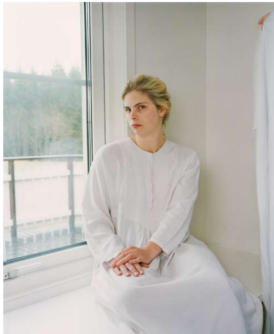
SUSANNE KARLSSON / PORTRAIT PHOTOGRAPHY WORKSHOP 03: SJÖAFALL

MR: This new way of working placed me in an uncertain position in terms of copyright. I have decided that I have the copyright to the photographs but I always account for who has the copyright to the ideas for the scenes. In the two first projects, I photographed the mothers' presentations on the walls. Those photographs were obviously mine. But then I became more interested in visualising more of the processes that evolve in the course of the projects. In a different way than before, I came to view the working process as a part of the artistic work. I looked for ways of depicting it, which involved experimentation.