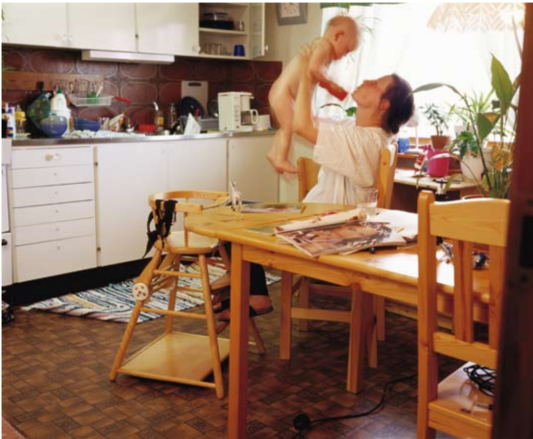
LOTTA ZIMMERMAN / SELF-PORTRAIT WORKSHOP 03: SJÖAFALL © MIJA RENSTRÖM 2003