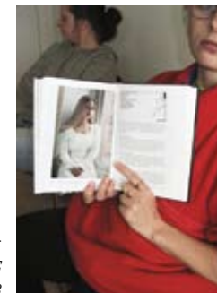
REFERENCE IMAGE: PORTRAIT PHOTOGRAPHY BY LENNART NILSSON / STUDIO MARIE 2003