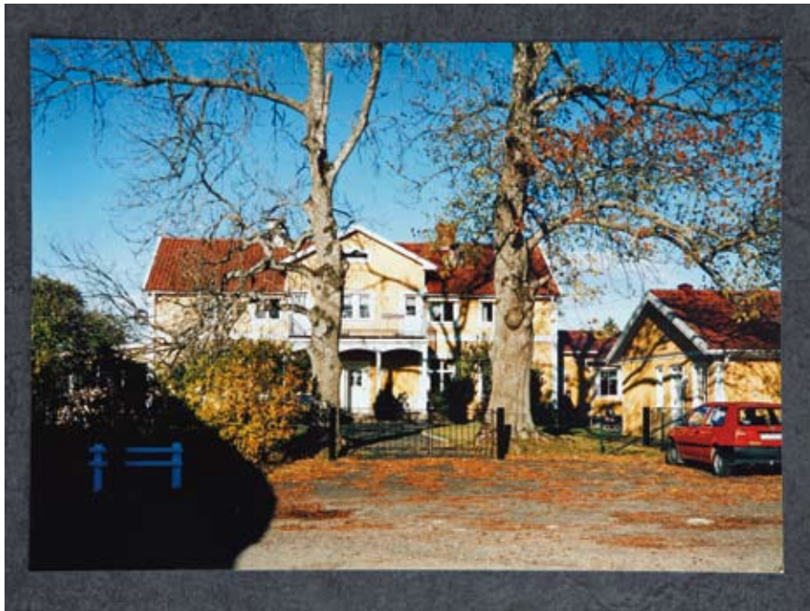
THE RESIDENTIAL TREATMENT CENTRE SJÖAFALL'S MAIN BUILDING PHOTO: MIJA RENSTRÖM 1997

The residential treatment centre welcomes mothers and children with psychosocial problems. The treatment period is normally between one and two years and is commissioned by the social welfare service. The treatment centre has its own day care centre and school.