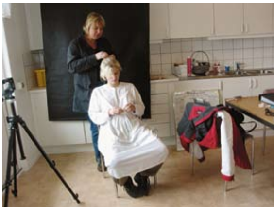
DOCUMENTATION IMAGE: SUSANNE KARLSSON / PORTRAIT PHOTOGRAPHY. WORKSHOP 03: SJÖAFALL PHOTO: MIJA RENSTRÖM 2003

They were on a roll as they started describing their lives in pictures. They created long stories which we helped to cut down to one or two scenes each. This was mainly due to lack of time. In the course of the project, the treatment centre was regrettably sold and we had to conclude the workshop earlier than expected. That's why we had to do all the scenes in two days.