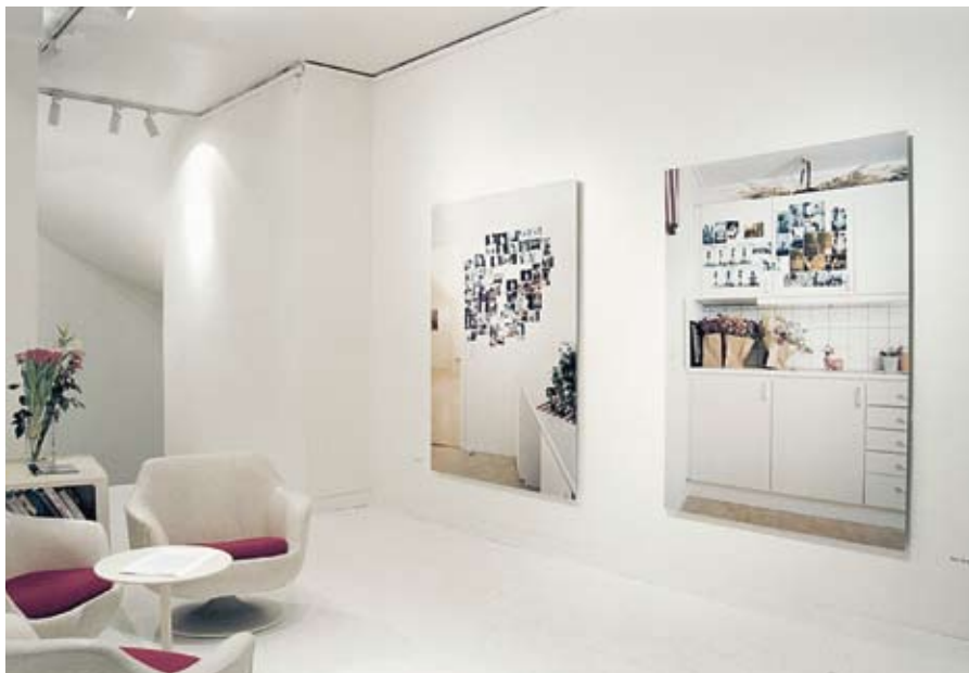
INSTALLATION VIEW FROM THE EXHIBITION WORKSHOP 98: SJÖAFALL INDEX, STOCKHOLM 1999 PHOTO: MIJA RENSTRÖM 1999

material. I thought a lot about whether to make the institution identifiable or not. There are so many preconceived ideas about treatment centres and I didn't want them to overshadow the project. Partly it was a matter of protecting the participants.