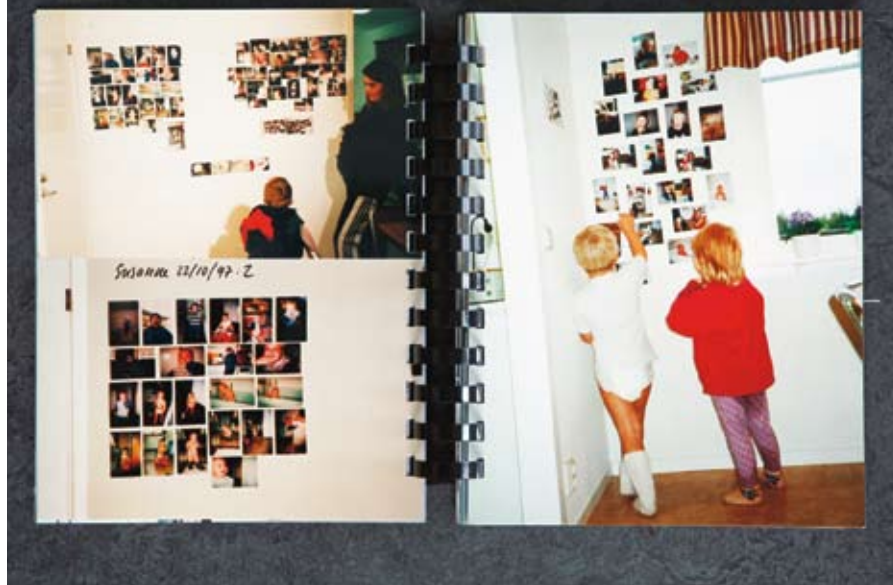
BOOK WITH DOCUMENTATION IMAGES FROM WORKSHOP 98: SJÖFALL PHOTO: MIJA RENSTRÖM 1998