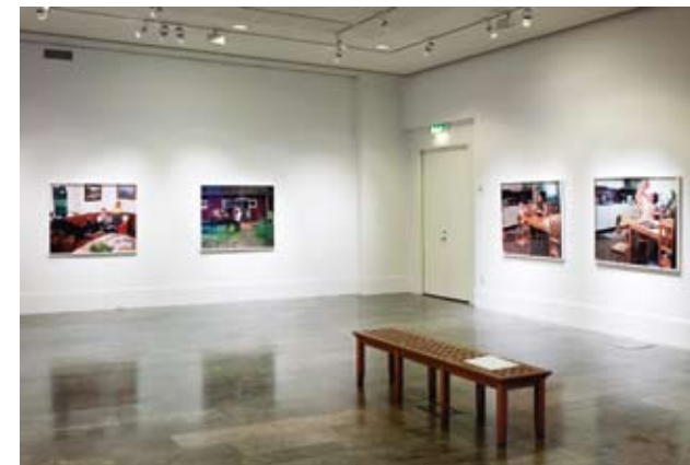
INSTALLATION VIEWS FROM THE EXHIBITION FRÅN OSS/FROM US STENASALEN, GÖTEBORG MUSEUM OF ART, 2006